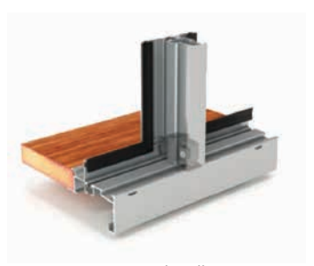
Patented mullion connection system