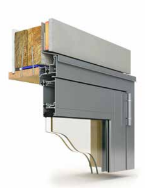
Hinge Door Head